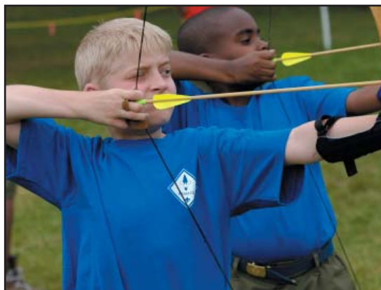
Have FUN at the Archery range!