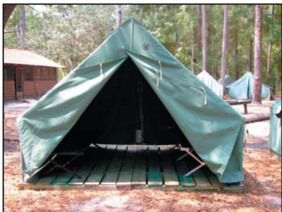
Use a Camp tent (above), or bring your own.