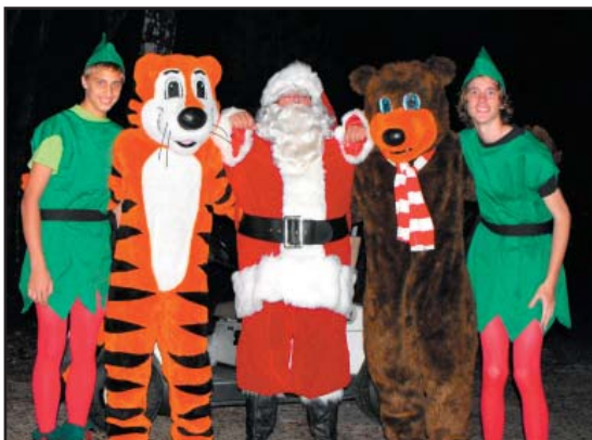
Cub Holiday Helpers!